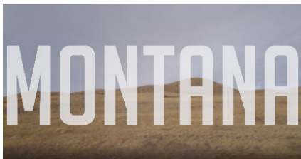
Hopa Mountain, Inc.