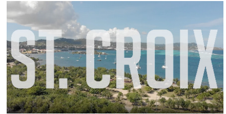
St. Croix Community Foundation

These organizations exemplify how Momentum Fund grantee partners use aspects of their culture to preserve, reaffirm—and in some cases—reclaim the humanity of the people in their respective communities. Their stories, combined with the myriad ways that other Momentum Fund grantees responded to the pandemic, provide a blueprint for effective racial equity and racial justice-focused grantmaking.