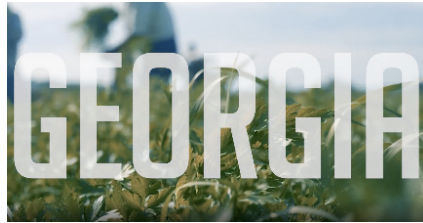
Latino Community Fund